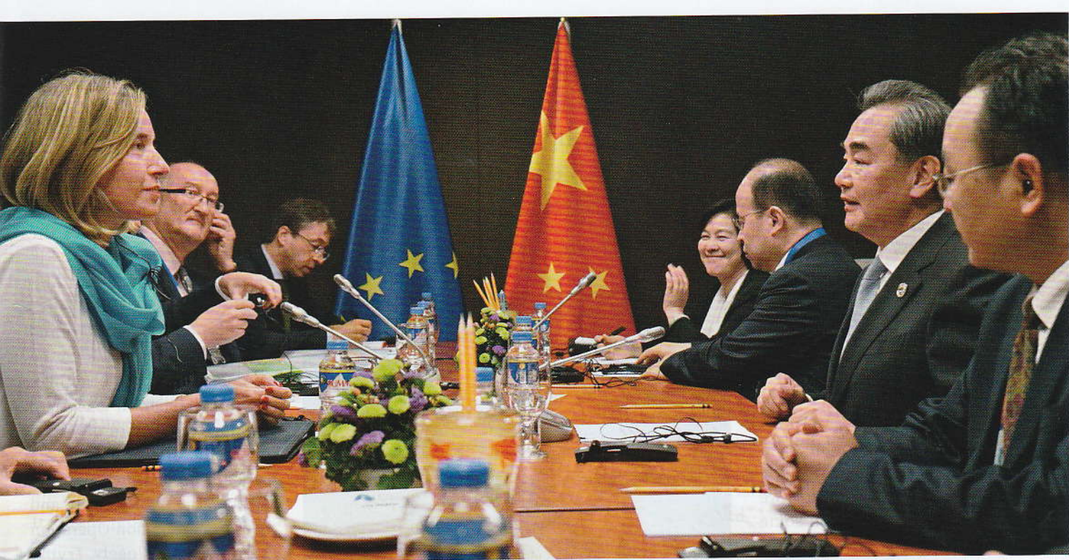
On August 7, 2017, Foreign Minister Wang Yi meets with the EU High Representative for Foreign Affairs and Security Policy Federica Mogherini on the sideline of the series of foreign ministers' meetings on East Asia cooperation in Manila, the Philippines.