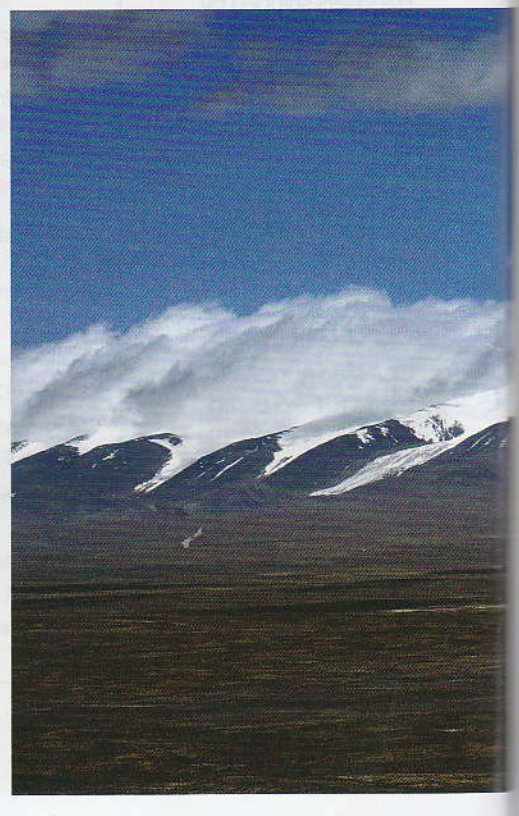
42 BEIJING REVIEW JULY 20, 2017